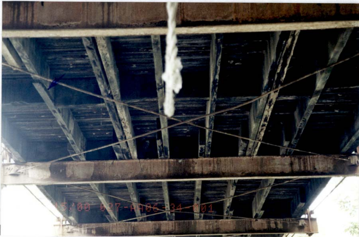
VIEW OF SUPERSTRUCTURE - LOOKING SOUTHWEST