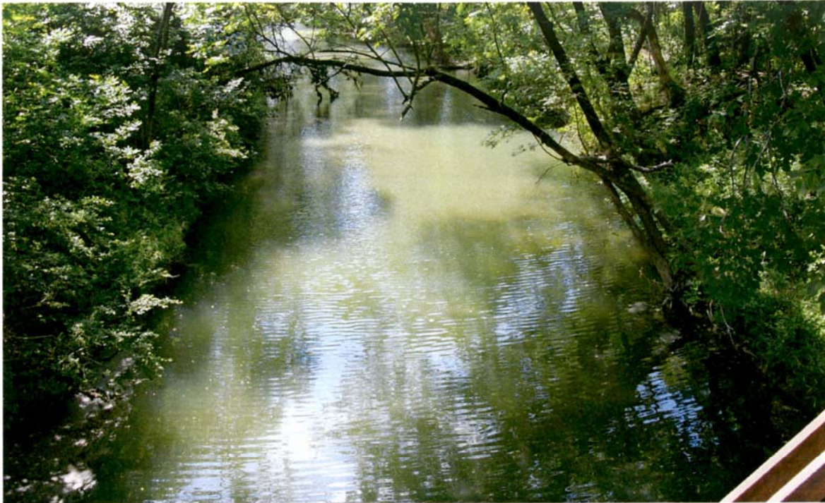
Channel View Looking Downstream (East)

Date: 5/6/2002 County: 027 Ctl Sec: AA06-34 Structure: 001