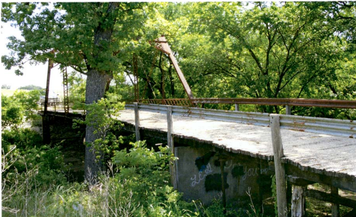
Side View Looking Northeast