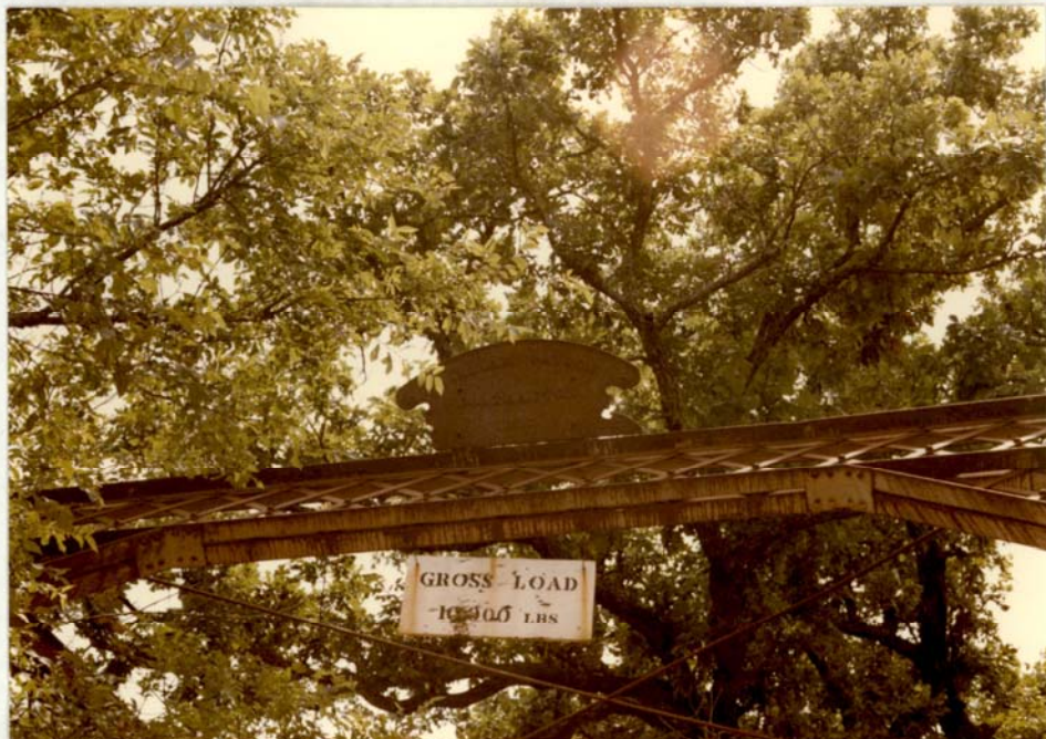
N. San Gabriel River