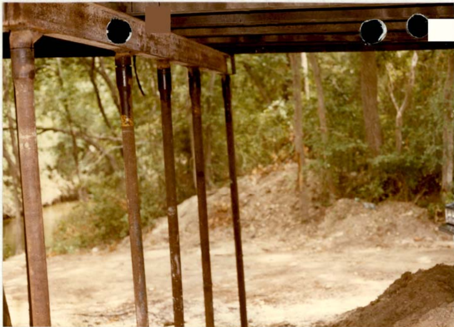
Str. 634-1 Co. Rd. 634 Burnet Co.