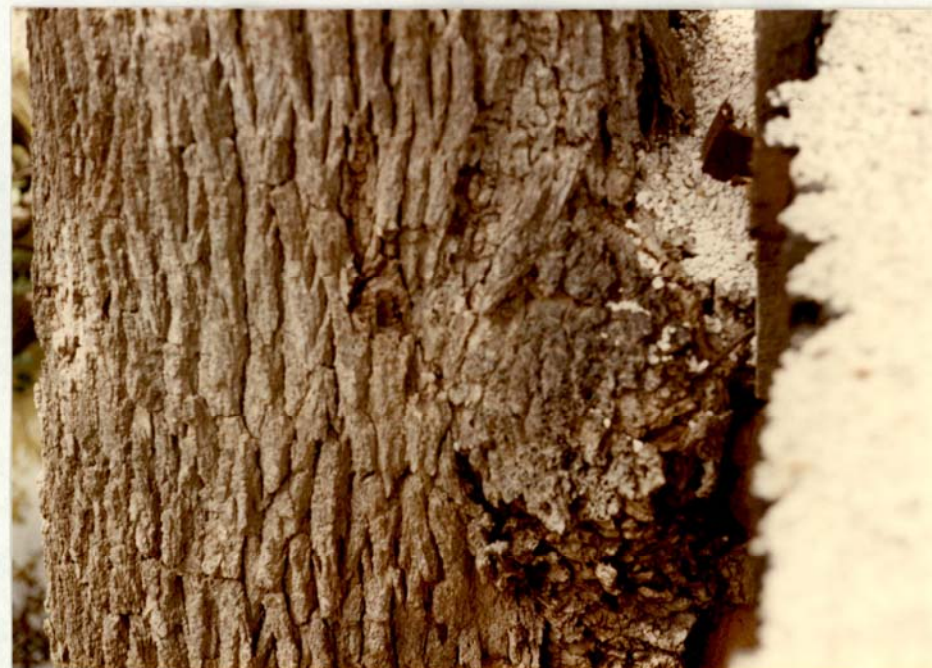
N. San Gabriel River