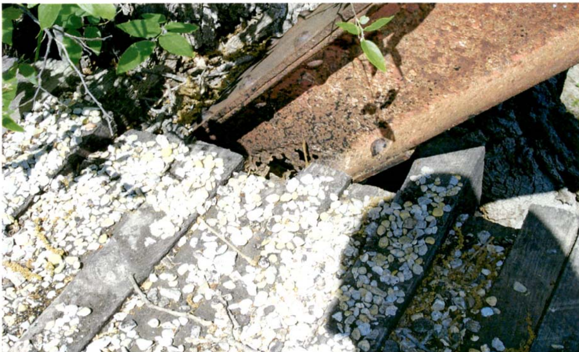
Rust Thru in South End Post of West Truss Rating: 4