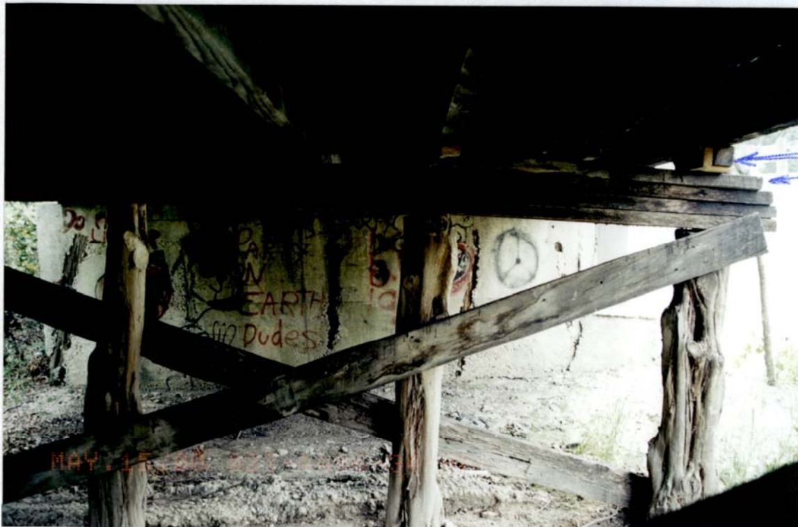
VIEW THROUGH BRIDGE - LOOKING SOUTHEAST

7" of Block To level-up for Plunged (sinking) pile