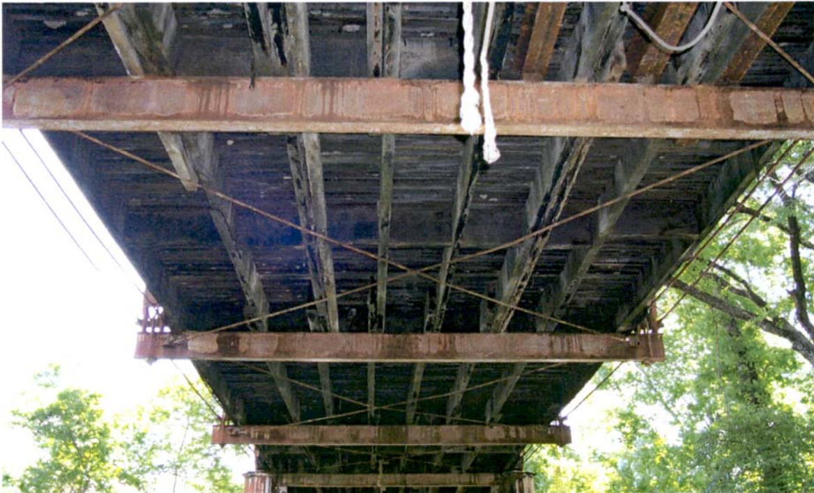
Underside View of Bridge Looking North