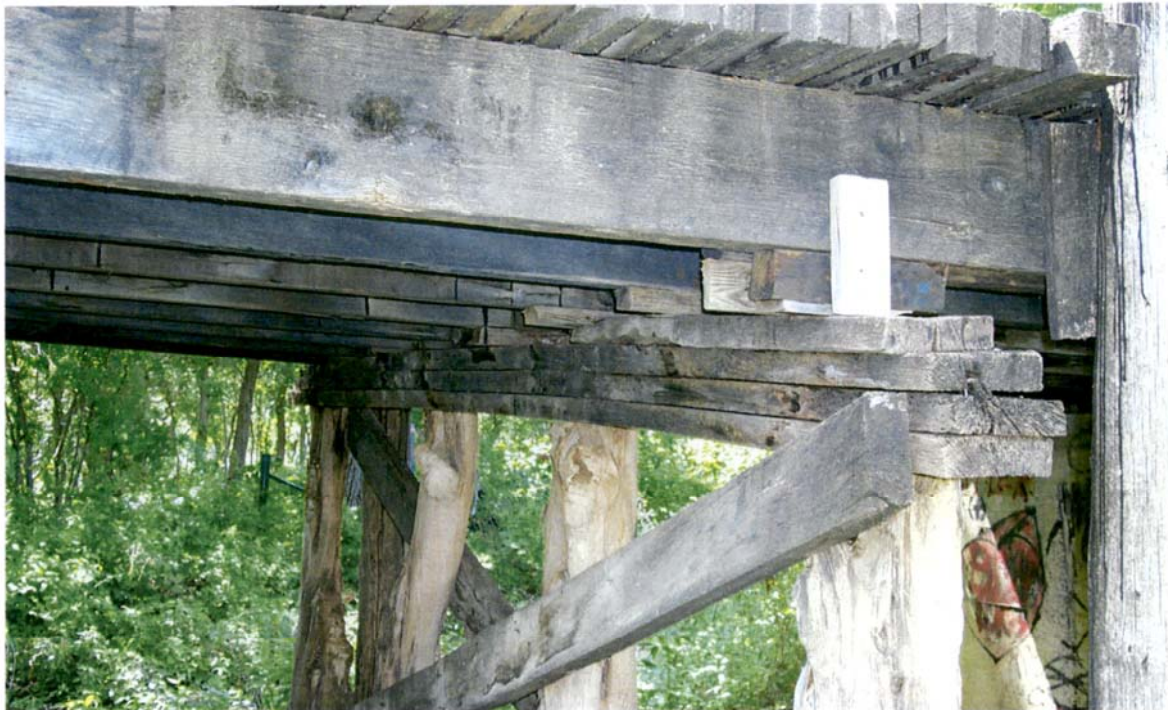
Differential Settlement Between East and West Ends of Bent #2 (From South) Rating: 1