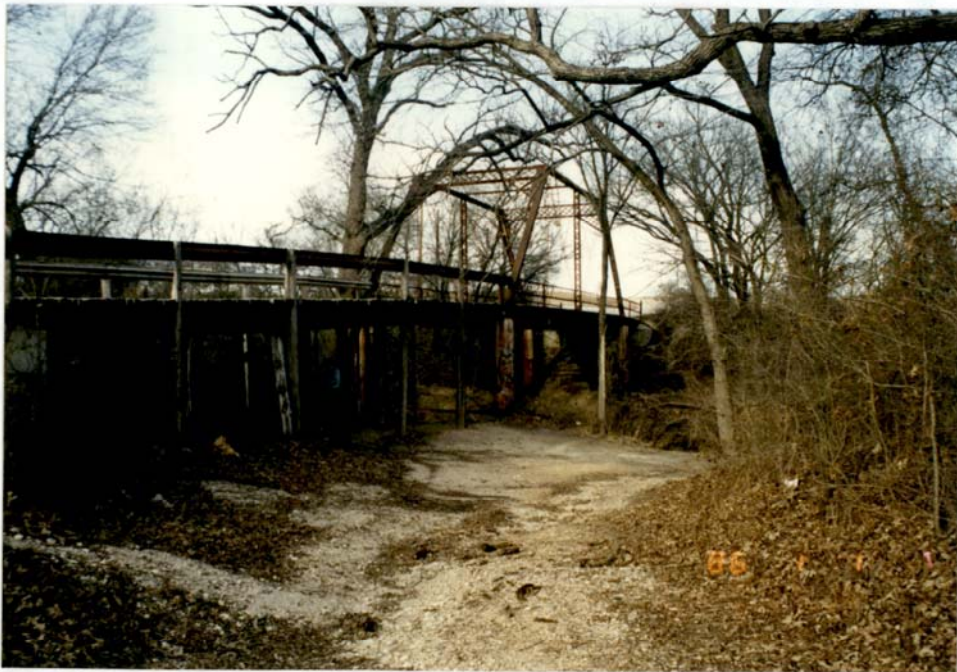
PROFILE: LOOKING NORTH

DATE: JANUARY 1992 CONTROL SECTION: AA0634 COUNTY: BURNET CO. (027)