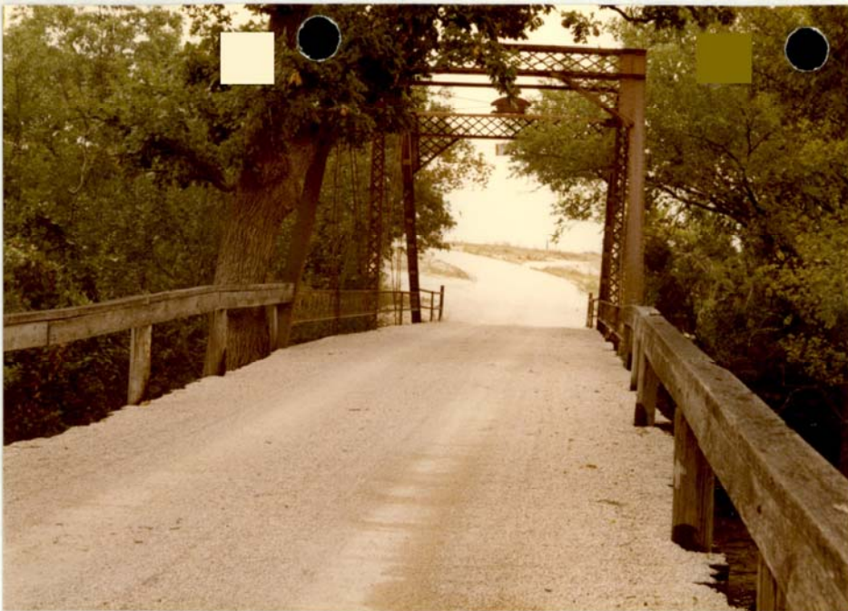
Str. 634-1 Co. Rd. 634 Burnet Co.