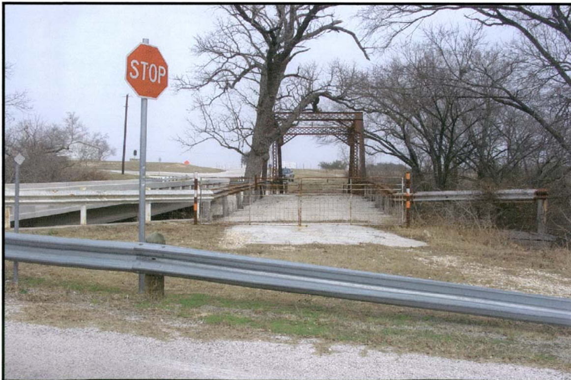
Historical Bridge; Closed to Traffic