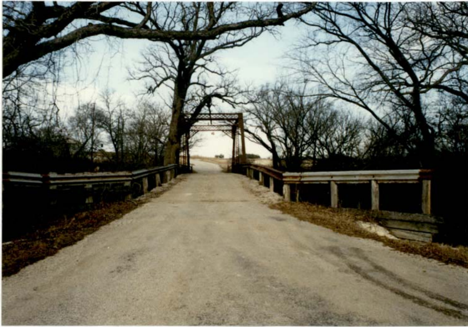
HEAD ON: LOOKING EAST