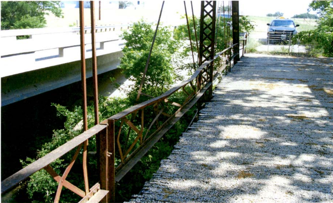
Impact Damage to West Bridgerail Rating: 6

Date: 5/6/2002 County: 027 Ctl Sec: AA06-34 Structure: 001