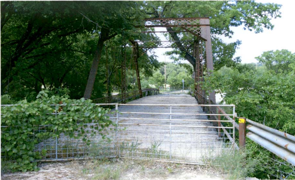
Roadway View Looking South

Date: 5/6/2002 County: 027 Ctl Sec: AA06-34 Structure: 001