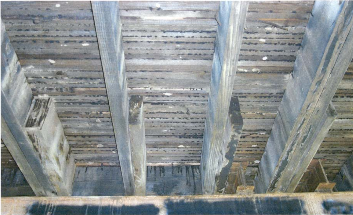
Underside View of Bridge Looking North

Date: 5/6/2002 County: 027 Ctl Sec: AA06-34 Structure: 001