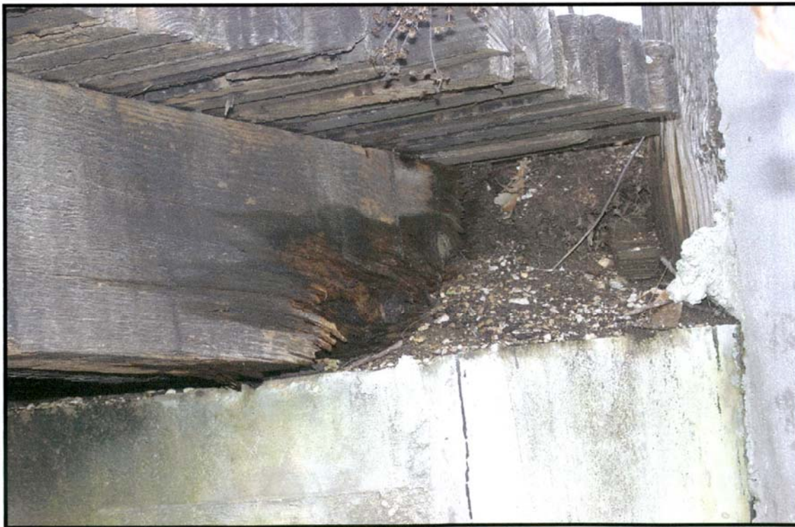
South End Post in West Truss